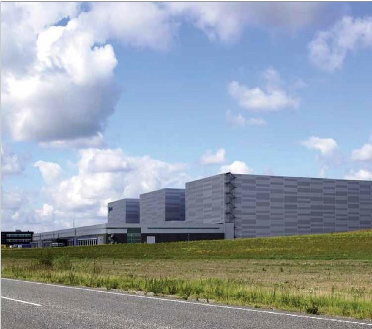
| Jysk Distribution centre, Denmark

Trimoterm panels are constructed from environmentally friendly materials, are 98% recyclable and provide a low CO 2 footprint during the lifetime of the building.