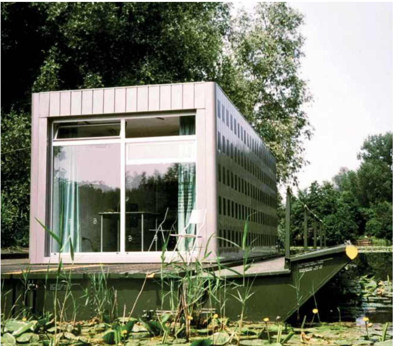
| Exhibition pavilion Hotelit, Netherland

Modular units can be shipped assembled or, to keep transport cost to a minimum , supplied flat-packed for on-site assembly with just the minimum of tools. Units can also be easily disassembled after use and transferred to a new location.